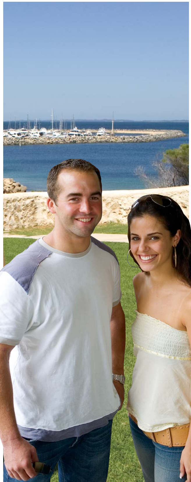
▲ Round House Lawn, Fremantle