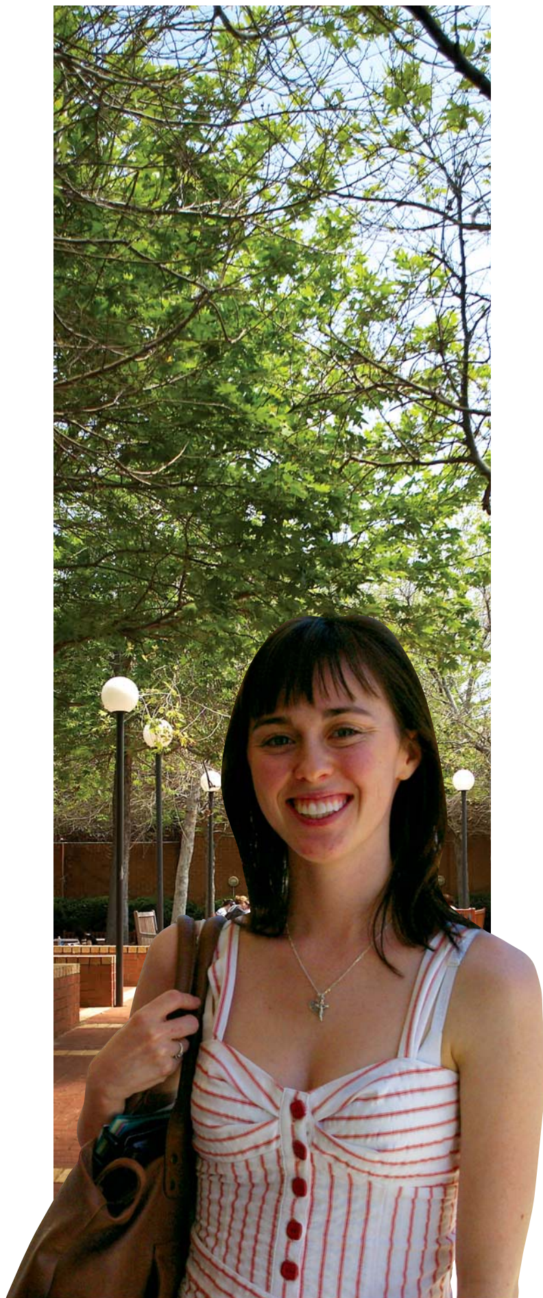
▲ Malloy Courtyard, Fremantle Campus

For further information The University of Notre Dame Australia dates go to www.nd.edu.au/currentstudents/calendarsAndTimetables.shtml