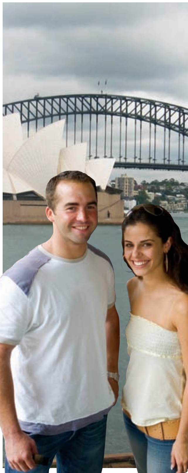
▲ Sydney Opera House and the Sydney Harbour Bridge

Cronulla $45 (South Sydney) – approx 18km from Sydney Airport