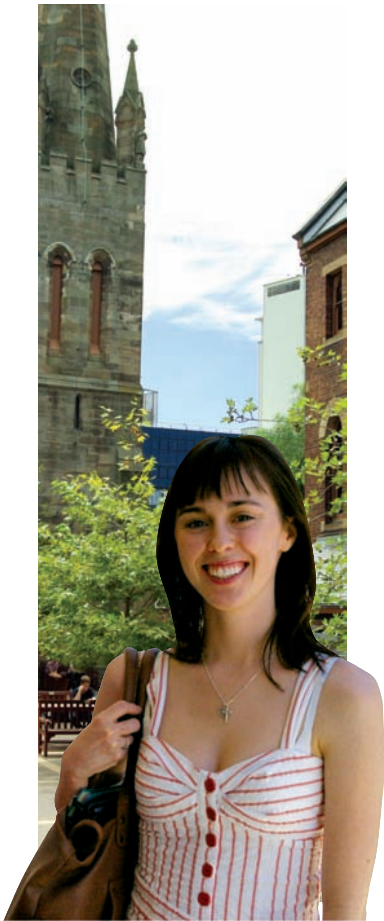
▲ Courtyard, Broadway Campus

For further information The University of Notre Dame Australia dates go to www.nd.edu.au/currentstudents/calendarsAndTimetables.shtml